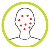
Rash (in all cases)