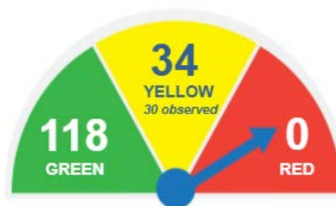
Figure 2. Number of green, yellow, and red days during the 2020-21 Season.

While October saw the most advisory days, November weather was also conducive to high PM as seen in some multi-day pollution episodes throughout the month.