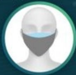
Cloth mask over medical procedure mask

In lab tests with dummies, exposure to potentially infectious aerosols decreased by about 95% when they both wore tightly fitted masks