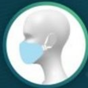
Medical procedure mask with knotted ear loops and tucked-in sides

Other effective options to improve fit include: