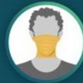
Nylon covering over mask