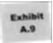
Exhibit A: BLUMENKRON RESIDENCE CEX-1 SITE PLAN