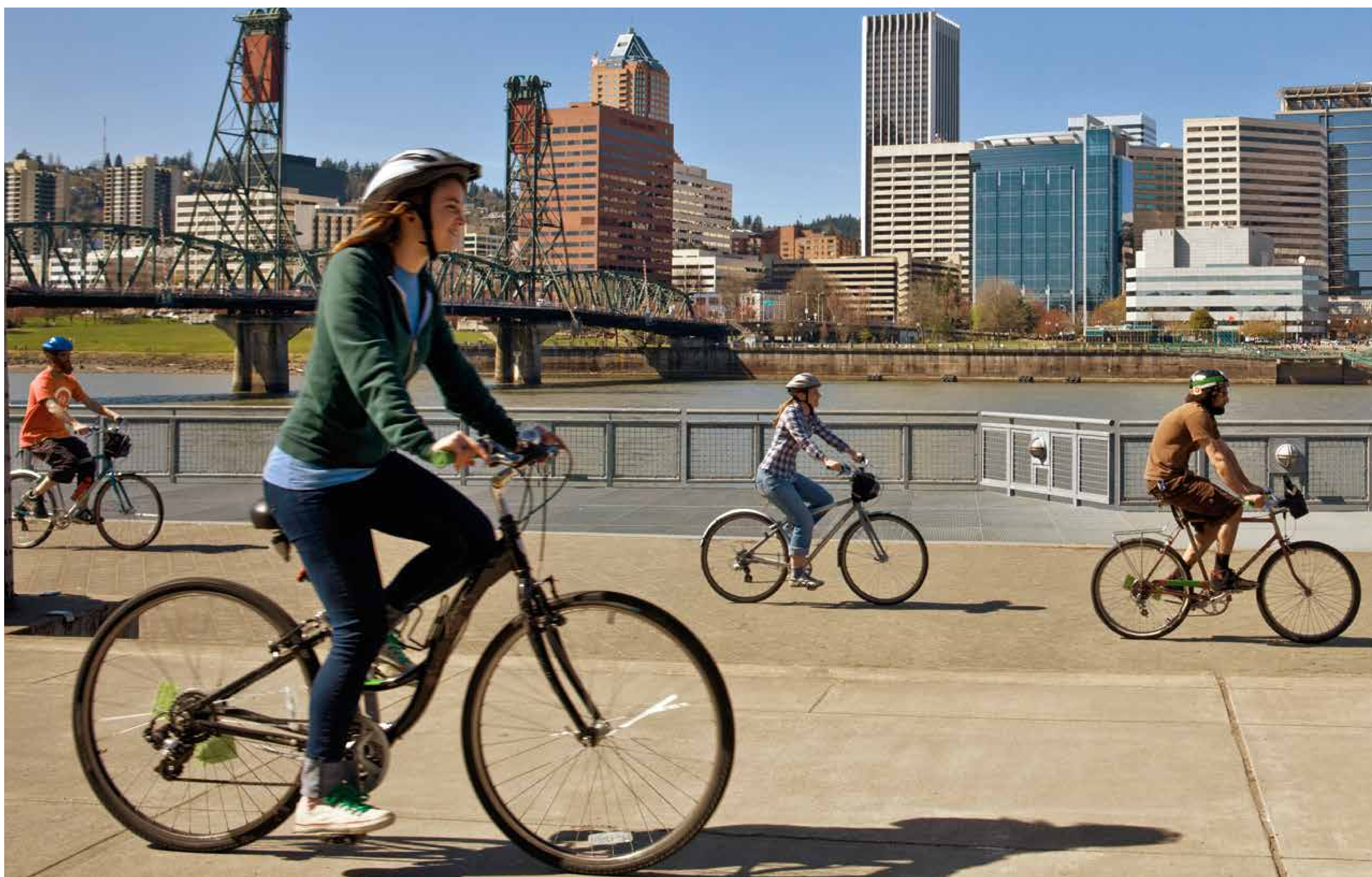
ENGAGING THE LOCAL BICYCLE AND PEDESTRIAN COMMUNITY