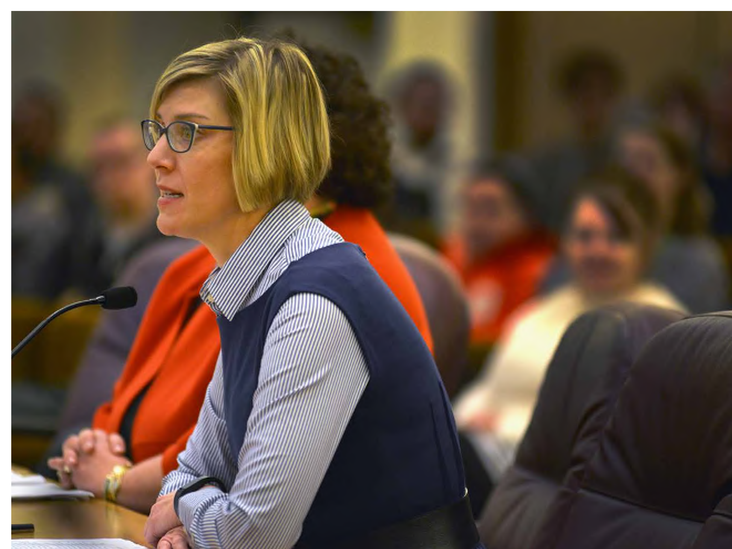
PUBLIC BOARD MEETINGS